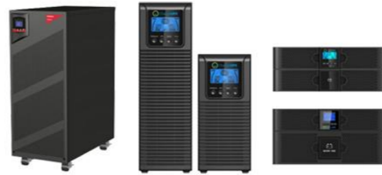
Uninterruptible Power Supply