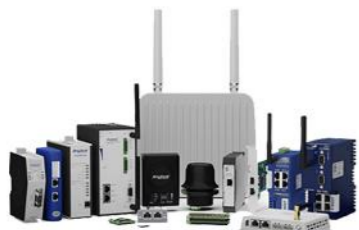
Anybus Gateways eWon