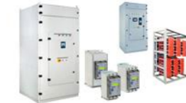
Medium Voltage Soft Starters Low Voltage Soft Starters