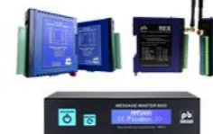
Environmental Monitoring System Facility Monitoring Server