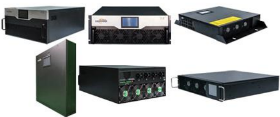
Active Harmonics Filter Static Var Generators