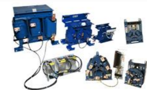
Power Quality Products and Filters