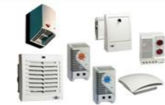
Filter Fans, Thermostat & Hygrostats, Enclosure Lamps