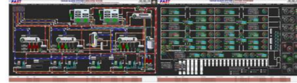
Edge, InTouch, System Platform