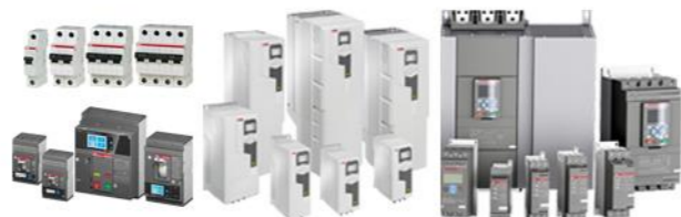
Circuit Breakers Variable Frequency Drives Soft Starters