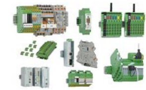
Terminal Blocks, TVSS, Cable Duct, DIN Rail