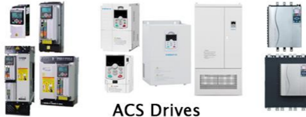
ACS Drives Variable Frequency Drives Soft Starters