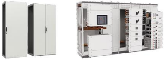
Free Standing Enclosures Fully Type-Tested Enclosures