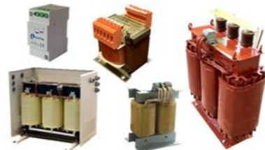
Active Harmonics Filter Control Transformers