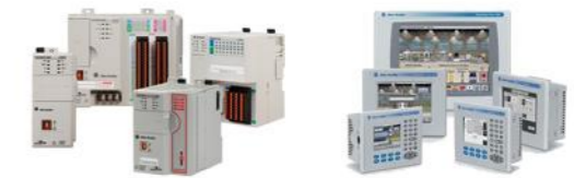
Allen Bradley Products