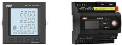
Energy Meters Gateways Current Transformers